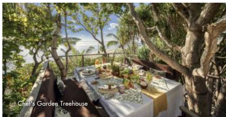
Chef's Garden Treehouse

The natural beauty of our island is reflected in the charm and ambience of our private dining locations. These venues are great places to enjoy a meal under starlight with both sunset views and ocean breeze.