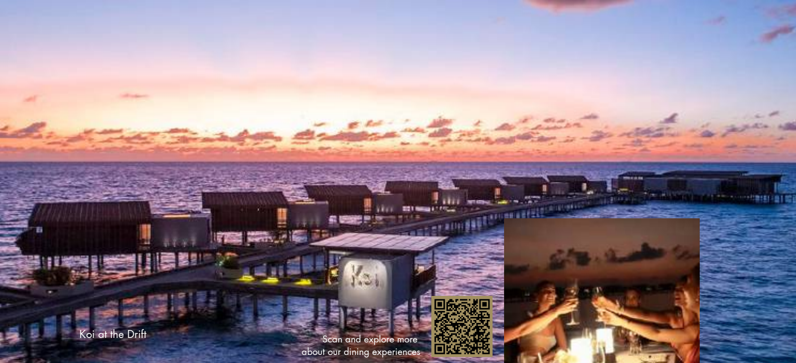
Koi at the Drift

Scan and explore more about our dining experiences